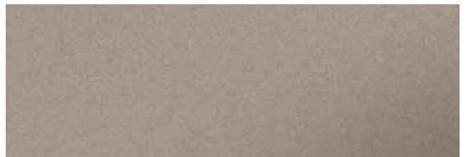
Metallic Gold RR42