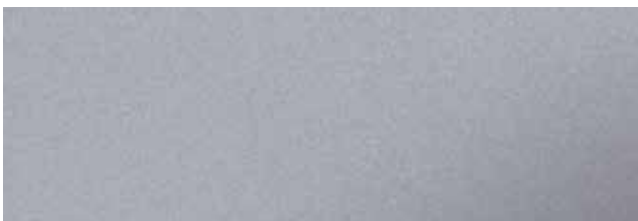
Metallic Sterling RR974/SS6045