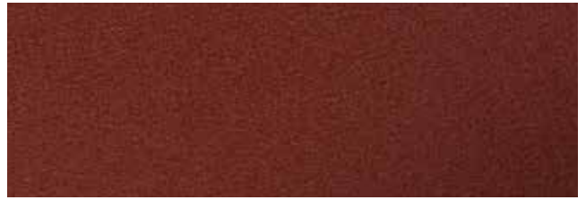
Cottage Red RR29/SS0758