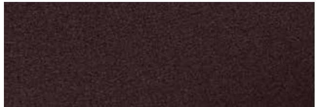
Chestnut Brown RR887/SS0435