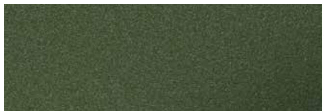
Leaf Green RR594/SS0874