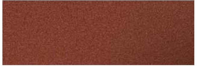
Tile Red RR750/SS0760