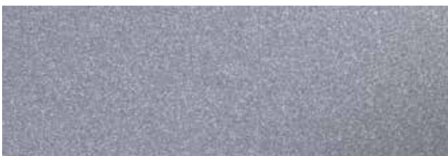
Metallic Silver RR40/SS0045