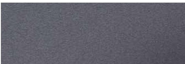
Metallic Dark Silver RR41/SS0044