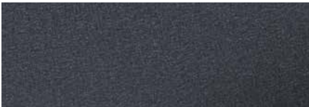
Anthracite Grey RR2H8/SS0087