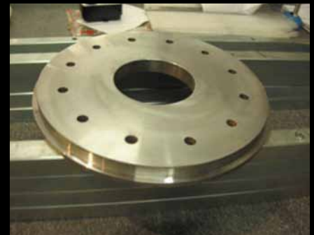
Hydraulic component made in

Toolox 33 previously made made in P20 or 4140