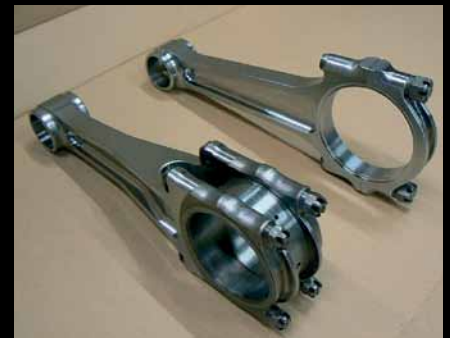
Toolox 44 Piston rods