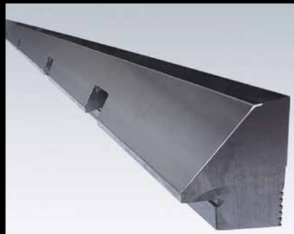
Toolox 33 Press brake tools