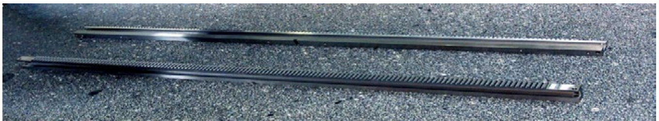
Fig 2. Toolox 33 precision machined gear rack

Toolox® has other excellent workshop properties. Being tempered at 590°C removes all residual stresses from the steel, making it possible to obtain remarkable precision when machining. An example is shown in Fig 2. The rack was obtained with only 0.004 mm sidewise deflection and 0.136 mm longitudinal deflection on 1.8 m measuring length. Starting by plate material instead of the previous round bar also gave large productivity benefits.