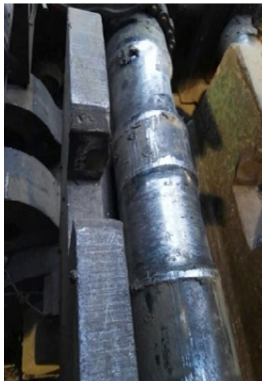
Standard 4340 hammer pin

Using Toolox® gives the guarantee of knowing the origin of the steel. All bars are ultrasonically tested. The hardness and crack resistance are guaranteed for all bars delivered.