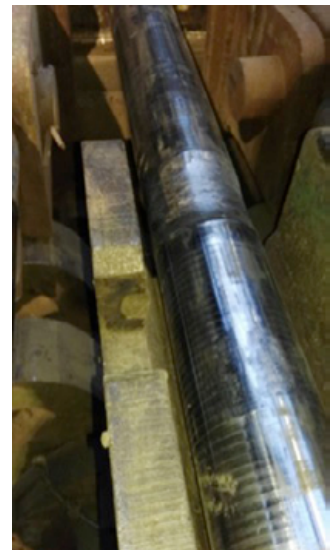
Toolox® 44 hammer pin