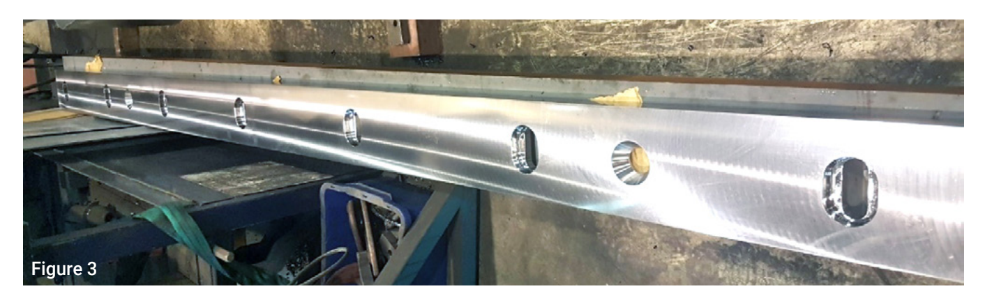
Figure 3. For machine components working under the most demanding conditions, laser hardening improves lifetime. SSAB is using laser hardened Toolox<sup>®</sup> 44 for cutting Hardox<sup>®</sup> and Strenx<sup>®</sup> steel plates, as seen in these shearing blades.

Figure 2. Another successful application is a bushing used in a shot blasting machine, seen in Figure 2. Around the bushing, a shovel wheel is placed. The wear from the wheel and the environment inside the machine represents severe conditions making laser hardening a perfect method to improve lifetime.