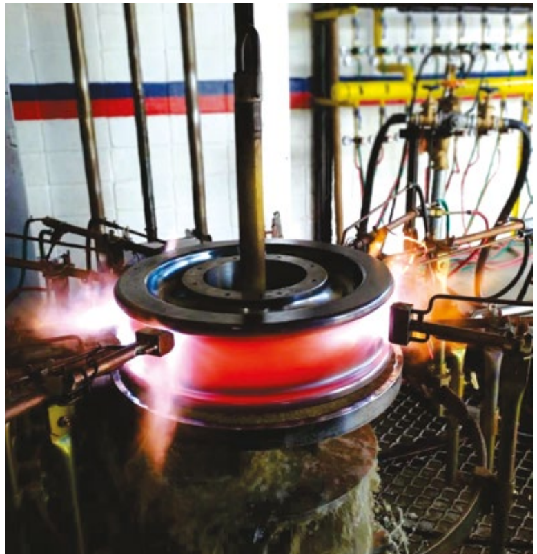
Pieces for the testing supplied by Toolox® distributor Serrametal.

Combustol Tratamentos Térmicos being doing quality heat treatment since 1975 knows perfectly how to get such results.