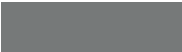
Metallic Dark Silver RR41/SS0044