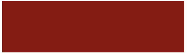
Cottage Red RR29/SS0758