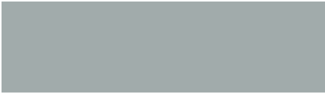
Quarry Grey RR287/SS0244