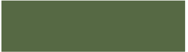
Leaf Green RR594/SS0874