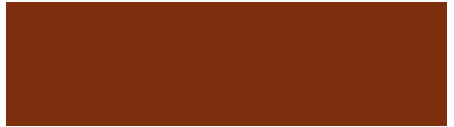
Tile Red RR750/SS0760