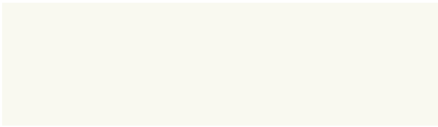
Snow White RR19/SS0001