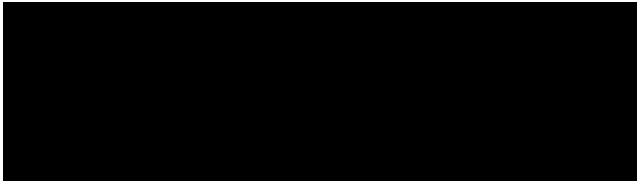
Nordic Night Black RR33/SS0015